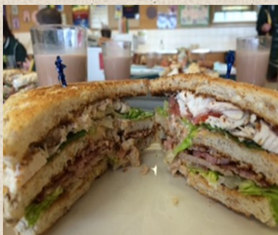
Year 7 Club Sandwich