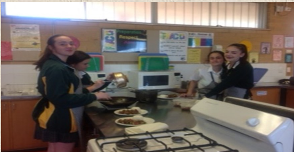
Year 11 Food Technology

Students have been busy cooking up a storm in the kitchens.