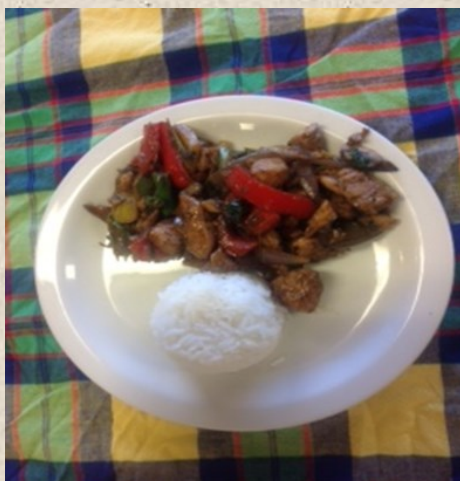
Year 11 Hoisin Chicken Rice Tumblr