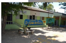
Sri Udom Orphanage Sing Buri Thailand