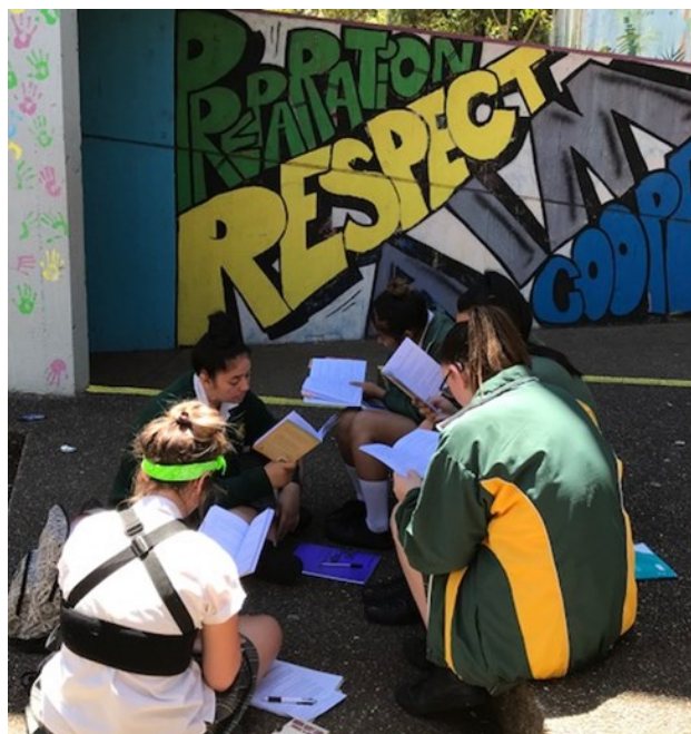
Standard English students taking the opportunity to work with their peers.