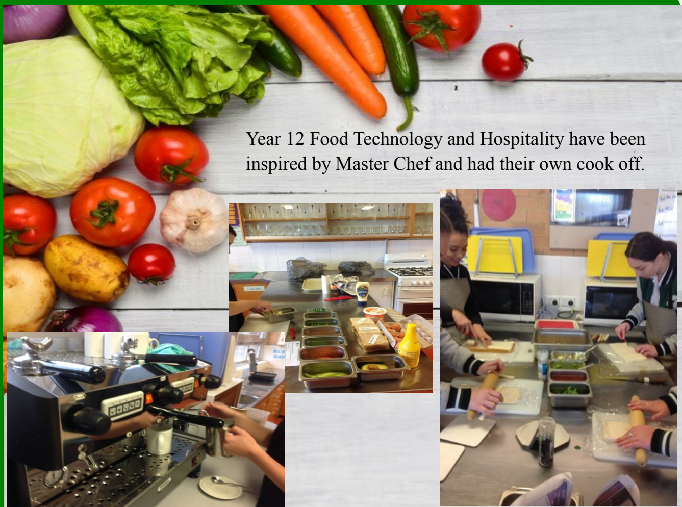
Year 12 Food Technology and Hospitality have been inspired by Master Chef and had their own cook off.

Year 10 have been busy in the kitchens designing celebration cakes. The students had to decorate and design their own cakes.