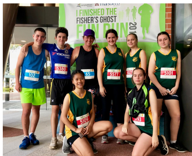
A big congratulations to the students who competed in Leumeah High School colours at the Fishers Ghost fun run.