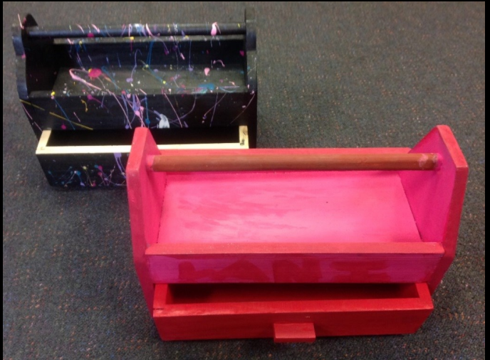
Year 8 Technology Mandatory Carry All Project