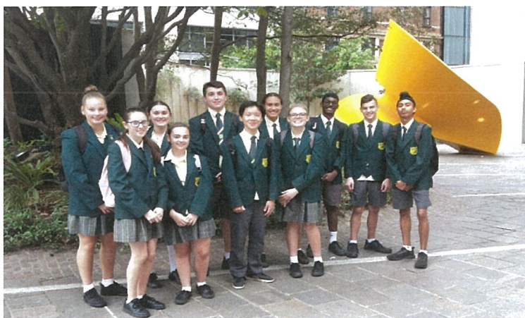
LEAPS students 2019 outside the Curwood McCabe Law Firm at the MLC Centre

It has been a pleasure to coordinate the LEAPS program again this year. The students who have participated in this program have represented Leumeah High School with pride and have upheld the school values of 'preparation, respect, aim and cooperation' to the utmost standard. Throughout the LEAPS program, it has been remarkable to watch these students develop into even more informed, motivated and confident young people, with many of these students demonstrating outstanding leadership qualities and characteristics conducive towards future successes.