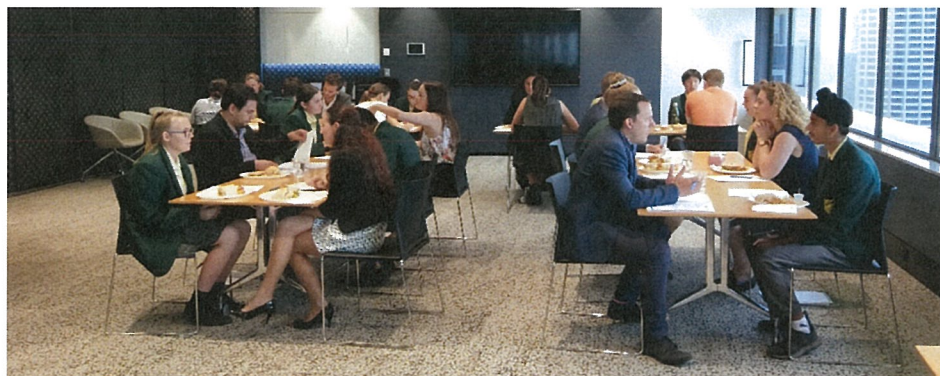
LEAPS students 2019 practising job interviews with their mentors at the CurWood McCabe Law Firm at the MLC Centre