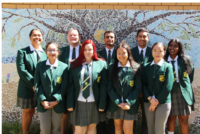
2020 Leadership Team