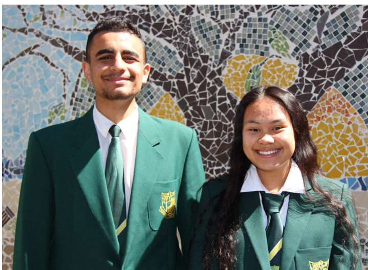
Our School Leaders