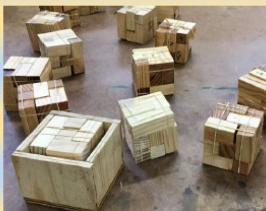
Year 12 Industrial Technology Timber – resin pour