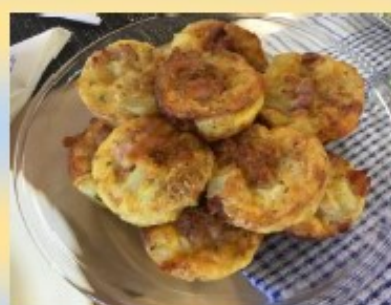
Year 8 3D Timber projects