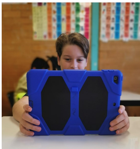
Year 7 Students - Online Learning